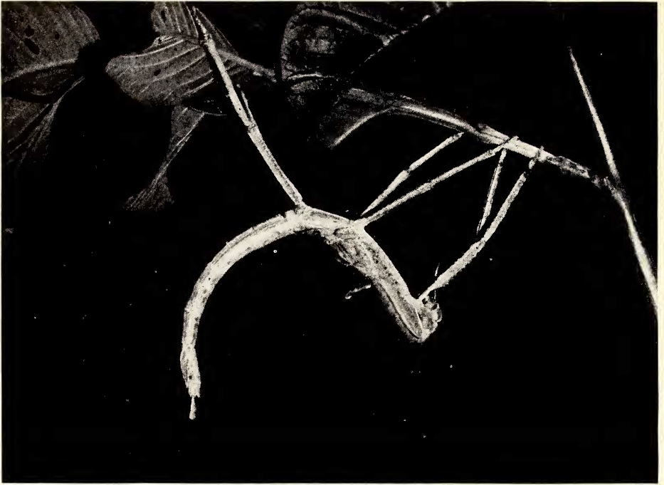
The nymph in position for ecdysis. The old skin has split along the thorax and the body is working out.